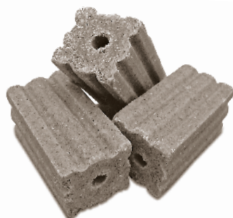
Photo may not be representative of a label-consistent bait placement